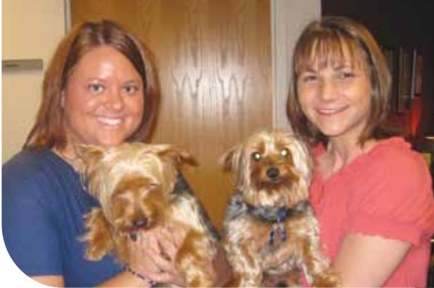
Top: Swerdlin & Company Take Your Dog to Work Day 2011